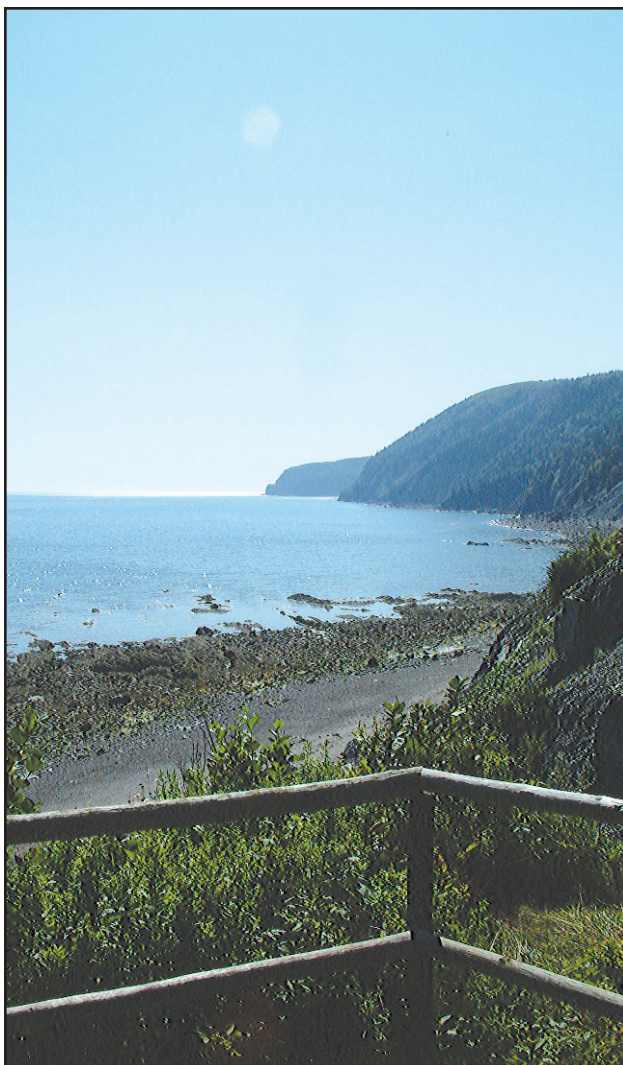
Cape Chignecto Provincial Park - The View