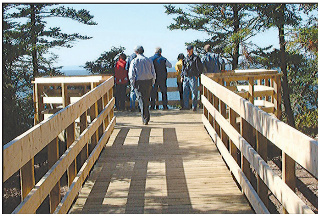
Cape Chignecto Provincial Park - The Boardwalk

For more information on Cape Chignecto, visit the website at www.capechignecto.net or call 392-2085. For reservations call 1-888-544-3434 or book on-line at novascotiaparks.ca .