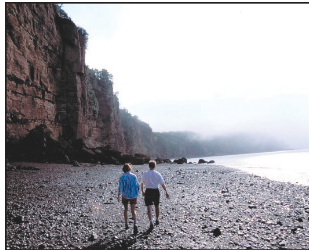
Cape Chignecto Provincial Park - The Beach Stroll